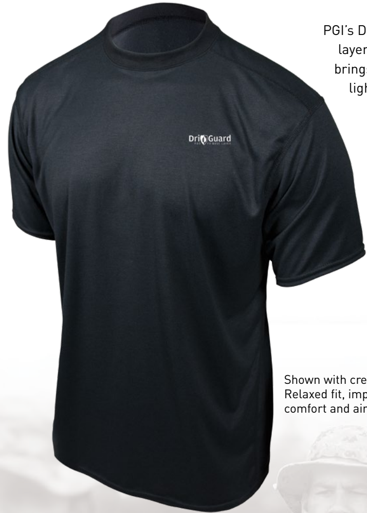
Shown with crew neck. Relaxed fit, improved comfort and airflow.

PGI's DriGuard™ PRO FR t-shirts and undergarments provide the last layer of defense and the first layer of comfort. This inventive fabric brings ease-of-wear and flame resistance together in an incredibly lightweight base layer weighing only 4.5 oz (150 gsm). DriGuard base layers are the perfect compliment to multi-layer flame-resistant clothing systems. DriGuard t-shirts and undergarments are non-contributory — meaning they won't ignite, melt, drip or adhere to the skin, enhancing the combined protection of your FR outer layers. The fabric is extraordinarily soft and comfortable, yet offers better protection than conventional cotton base layer alternatives.