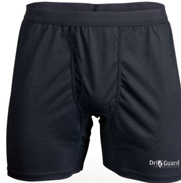
Legs stay put and won't ride up or constrict.

DriGuard PRO FR Base Layers provide "smart release" technology, releasing its unique antimicrobial properties when microbes are present. Fabric is treated with a powerful antimicrobial treatment that inhibits microbes with a trimodal efficacy, via zeolite carrier, by starvation, sterilization and suffocation, leaving no resistant strains behind. In addition to unparalleled antimicrobial performance DriGuard PRO FR Base Layers incorporate a powerful zeolite odor absorber capturing odor molecules released from the body for total odor control.