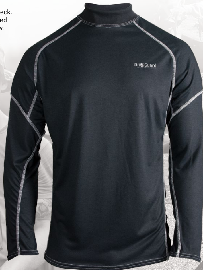
Shown with mock turtleneck. Multi-Panel 3D fit.